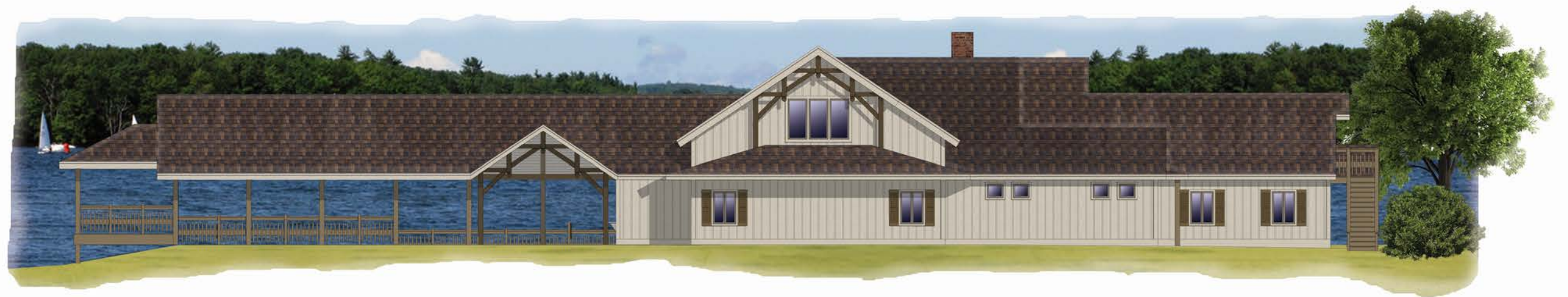
2 Entry Elevation Not to Scale